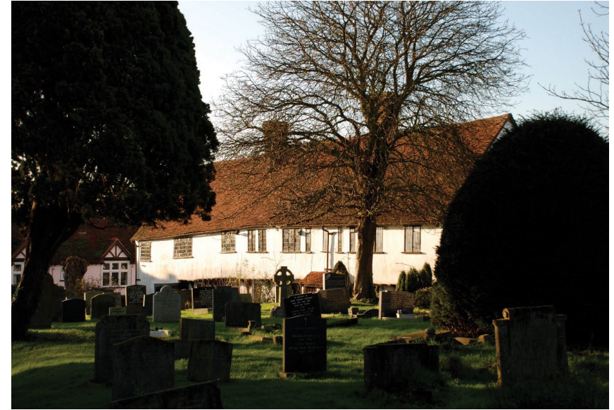
Back of the Guildhall, built 15th century, Churchyard, Finchingfield by Roger Cowen. © Finchingfield Almshouse Trust.